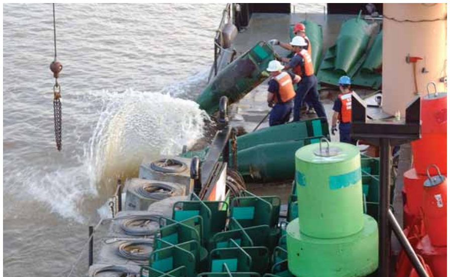
NATCHEZ, Miss. (May 19, 2004) —The crew of the USCGC GREENBRIER is responsible for maintaining aids to navigation along the inland waterways between Baton Rouge and Natchez.