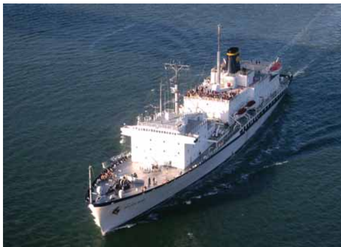
The TS GOLDEN BEAR is the training ship of the California Maritime Academy (CMA), a campus of the California University.

Sadly, 2015 was the last year that Auxiliarists proctored tests for the Coast Guard's Oakland REC and at the California Maritime Academy. They performed this service for the Coast Guard for more than eight years. Ω