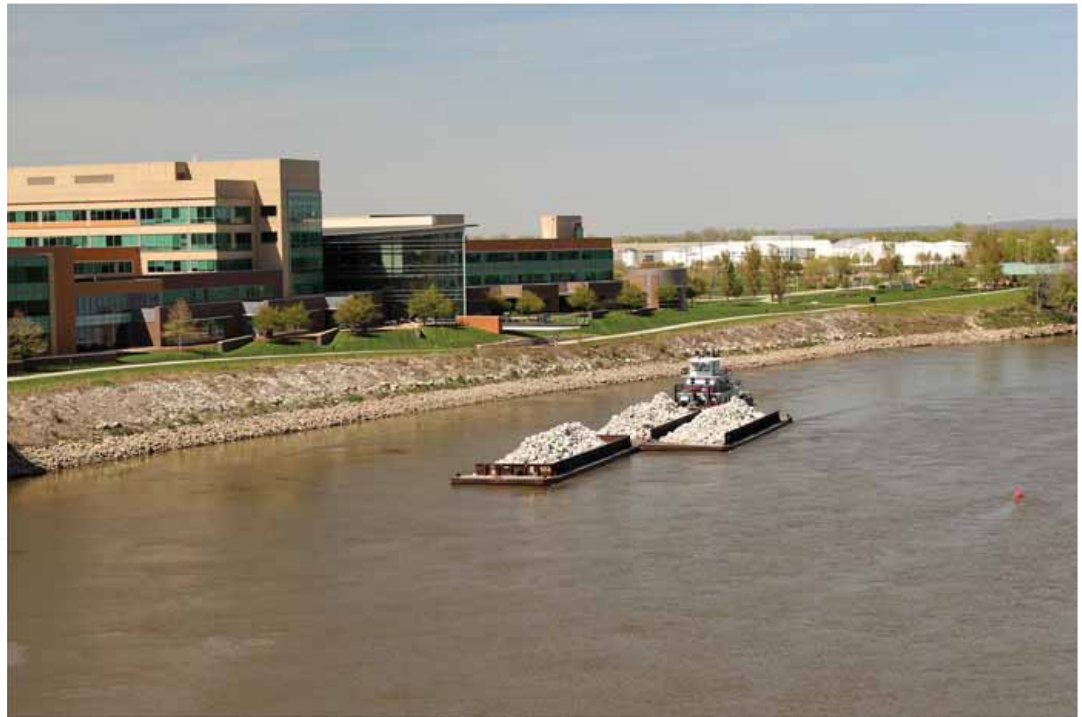
OMAHA, Neb., April 2015— Four years after floods devastated the western rivers region, a tug pushes barges filled with rocks down the Missouri River. The rocks are to be placed along the banks of the Missouri and Platte Rivers to help protect from erosion during floods and spring run-offs.

If this sounds a lot like the exact same process one follows with the Active Duty for the other 22 Marine Safety PQSs you are right! People move, things