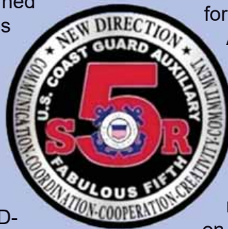
Image: Fifth Southern patch speaks to the pride all members have in their regions and missions.

Plans are underway for 2016. We already held an "all hands" MS meeting to discuss our objectives for this year. Numerous AUX-MEES and AUX-MSAM training sessions are planned throughout all three of our Sectors. We hope to utilize the "Go To" platform to teach the Good Mate and Introduction to Marine Environmental Protection courses. An overview of the Marine Safety programs will be presented at our District meeting in Richmond. MS staff is focused on getting the MS word out to the leadership this year and to overcome a former breakdown in the chain of communications. Finally, we are calling on those participating in MS activities to more faithfully record their MS hours on the appropriate Forms 7030 and/or 7029 (99C). Ω