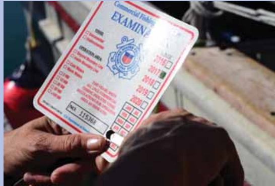
Commercial Fishing Vessel Safety Examination sticker.

The new mandatory exam is good for five years, but the local command is still requiring a two-year safety decal to be completed so that paperwork, expired flares, hydrostatic devices, registrations for radios, EPIRBS and many of the other items can be checked for safety.